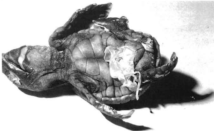
Figure 2 - Hatchling of Loggerhead Turtle ( Caretta caretta ) found in Ebro Delta (Spain). Dorsal and ventral view.

The presence of yolk sac seems to indicate that this animal is an unborn individual belonging to a clutch deposited on this beach. It is interesting to remark that the number of vertebral and costal scutes (6 in both cases, instead of 5) are higher than usual (Dodd, 1988).